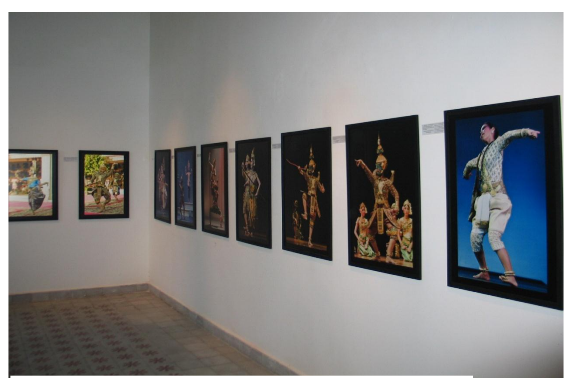
Photographs are hanging with the labels on the each top left.