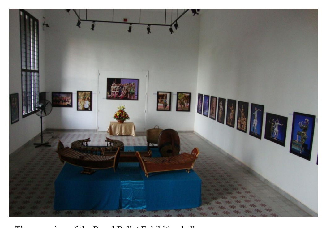
The over view of the Royal Ballet Exhibition hall.