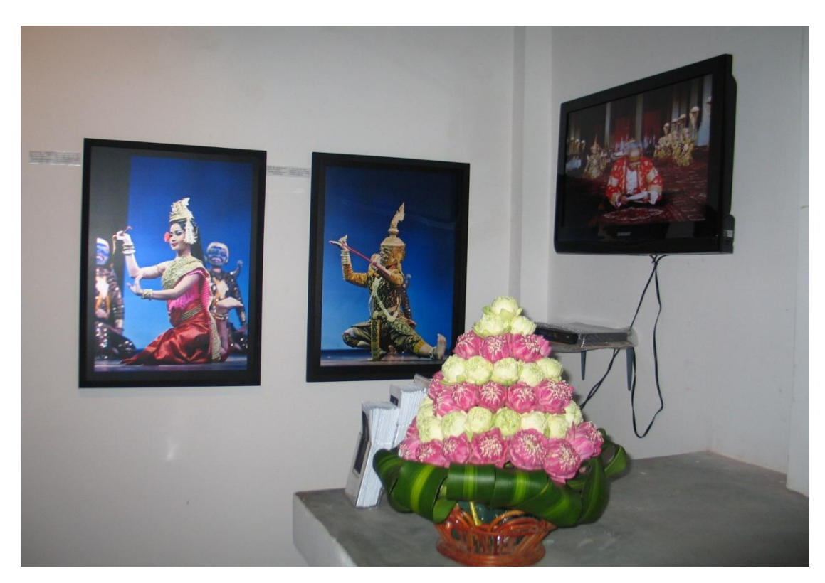
The DVD playing and the TV flat screen nearby the leaflets.