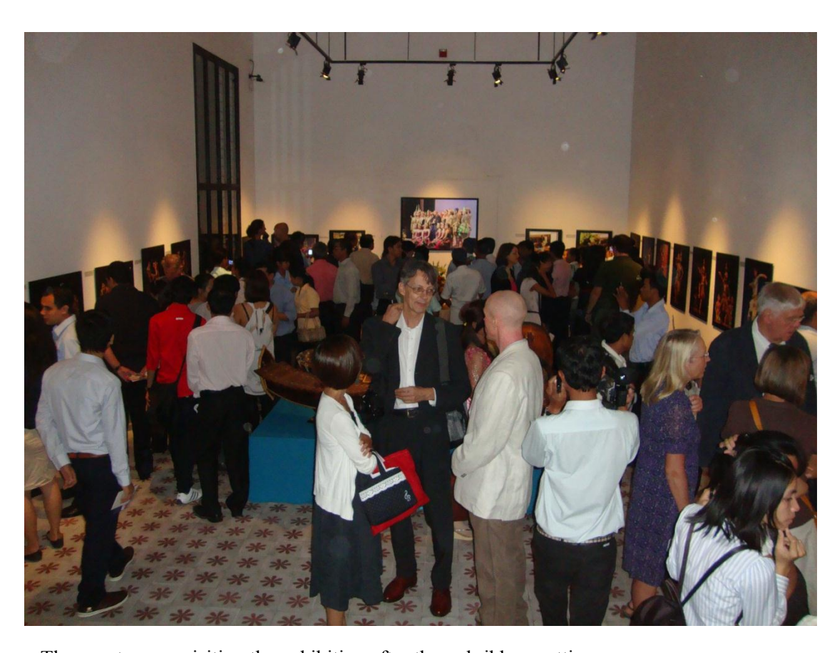
The guests were visiting the exhibition after the red ribbon cutting ceremony.